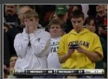
Cheering your team