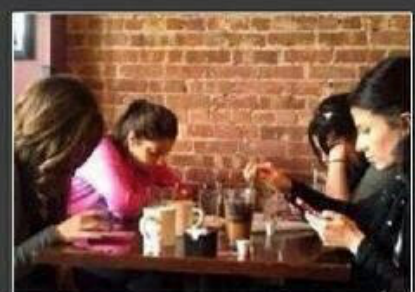
Having coffee with frens