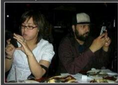
Out on an intimate date