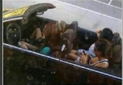
Enjoying the sights